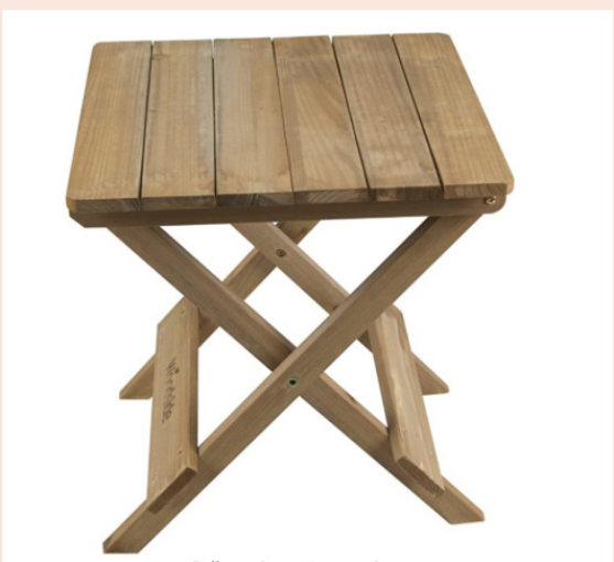
Small Wooden Tables