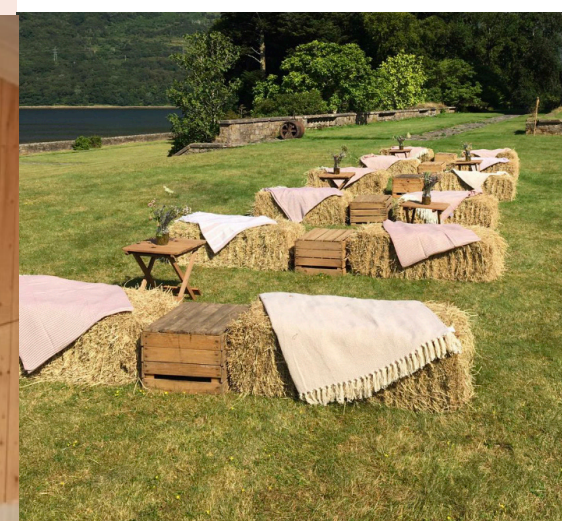
Haybales, blankets, tables and crates