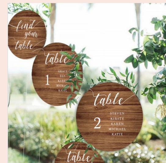
Hanging table plan personalised