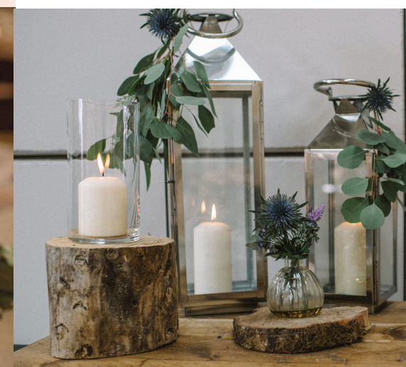
Table Decor Set