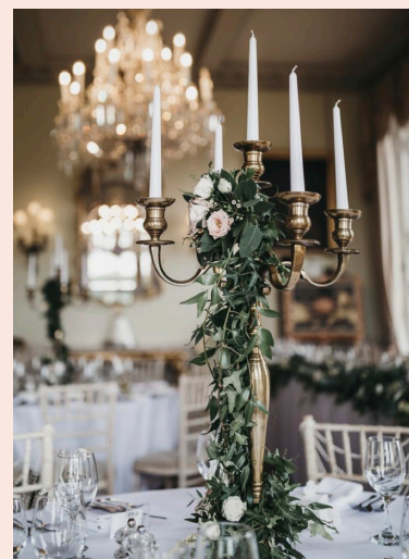
Candleabra (minus candles)