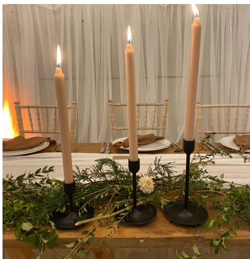
Black Candlesticks (minus candles)