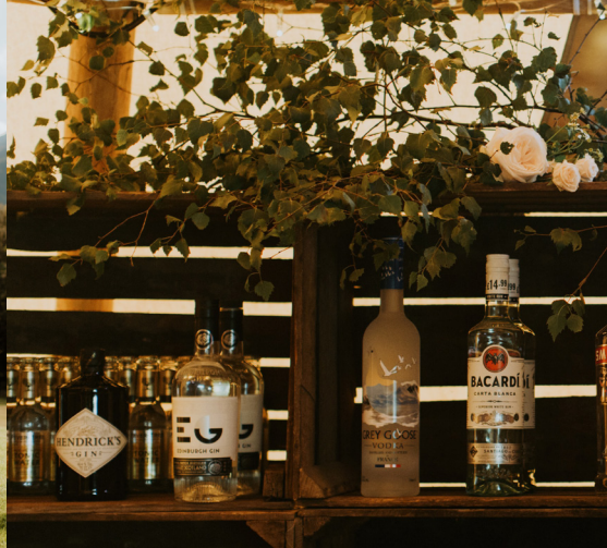
Bar Crate Gantry