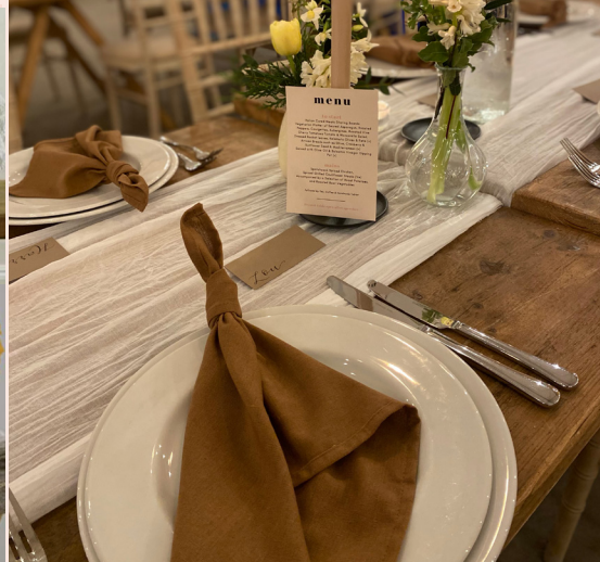
Burnt orange napkins