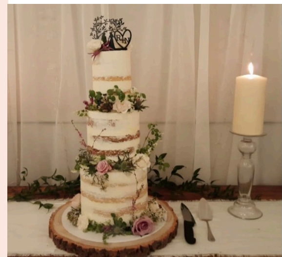
Large Glass Candle Holders