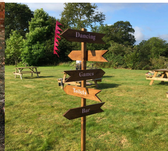
Directional Signage personalised