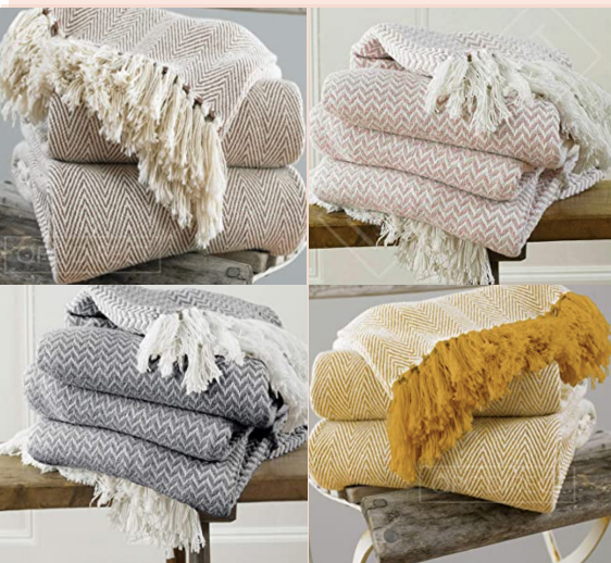
Various coloured Blankets