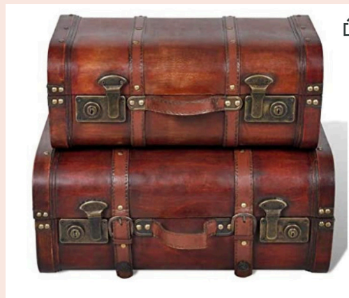
Vintage storage cases