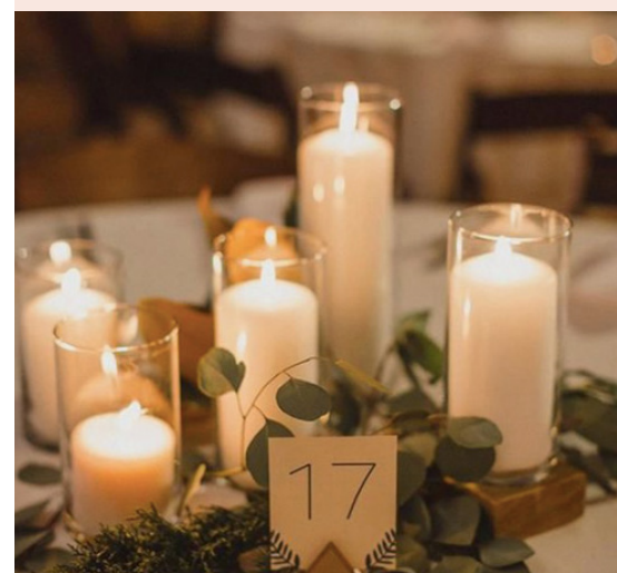
Pillar candles in Glass holders