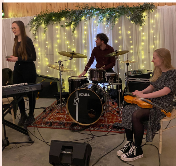
Fairy Light backdrop with decorative branch