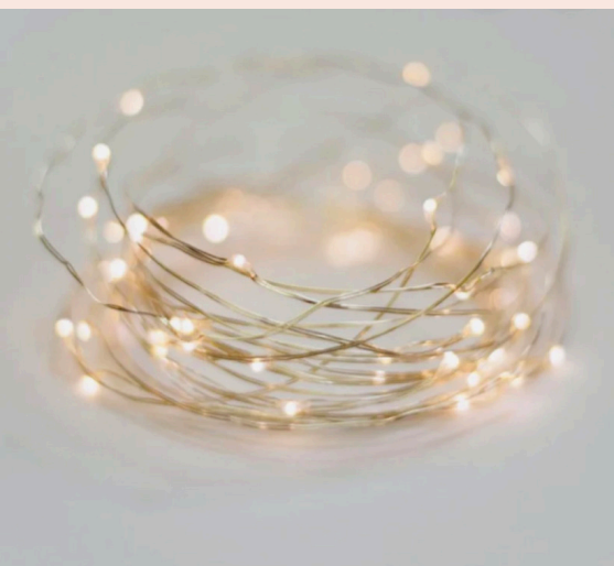
Fairy Lights (inc batteries)