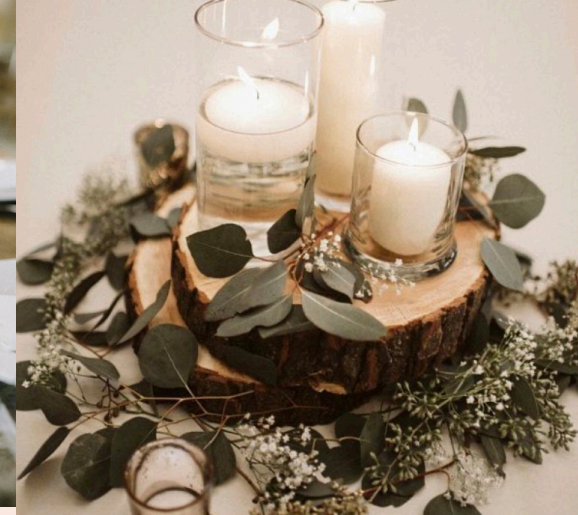
Wooden Table Slices