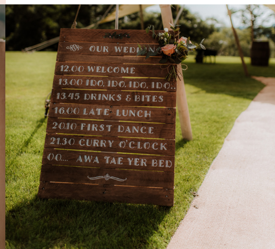
Order of the Day Palette personalised