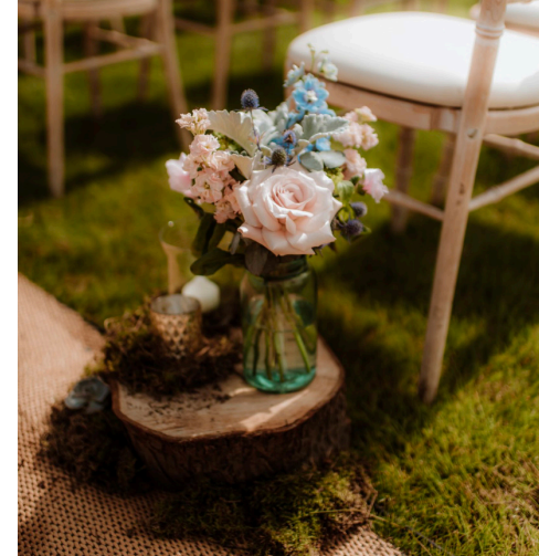
Pew Ends (logs, candles, moss)