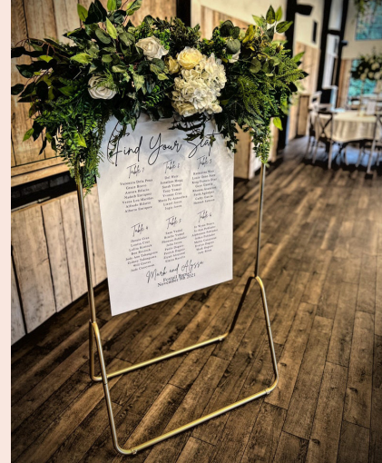
Stand for Table Plan