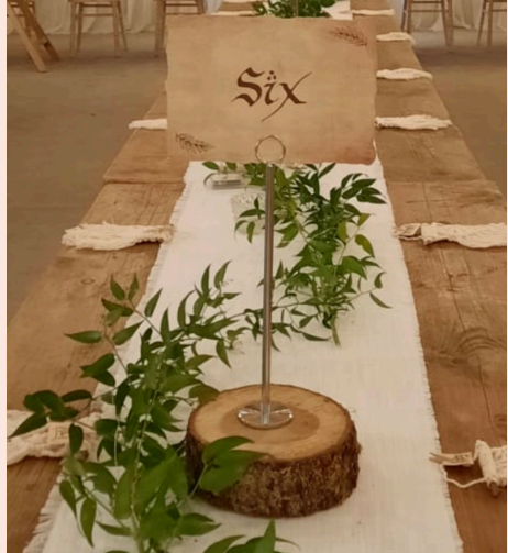
Table Number Stand (log plus metal stand)