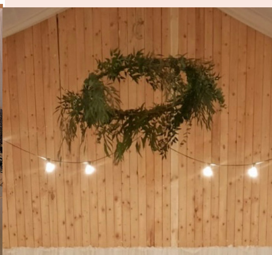
Hanging hoops with foliage