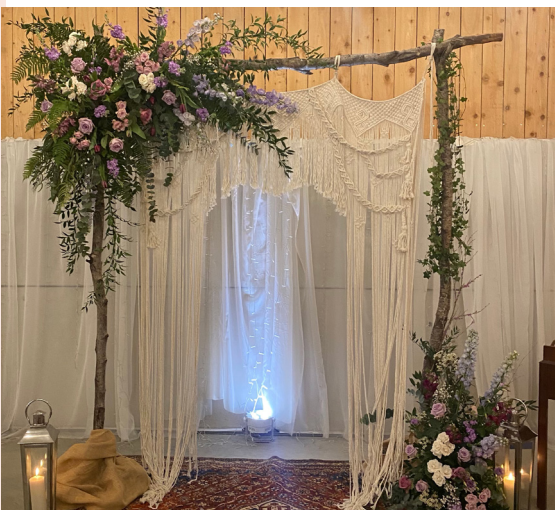
Macrame Boho Decor Piece