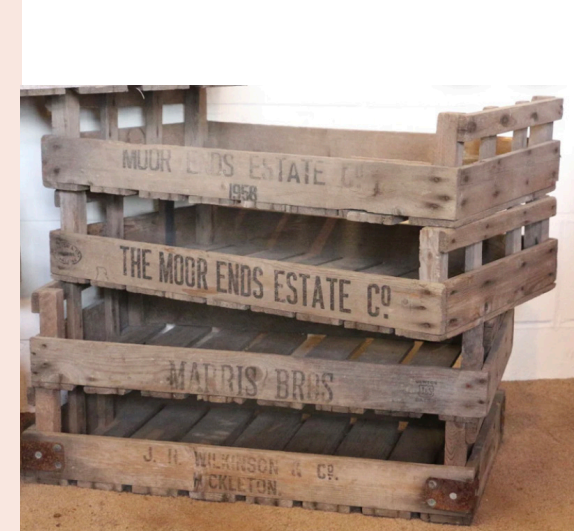
Fruit Crate Trays