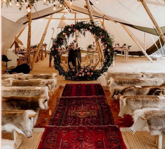
Large Boho Rugs