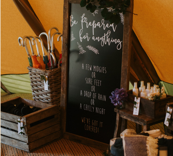
Guest Comfort Station (blankets, umbrellas, signage, midge repellent)