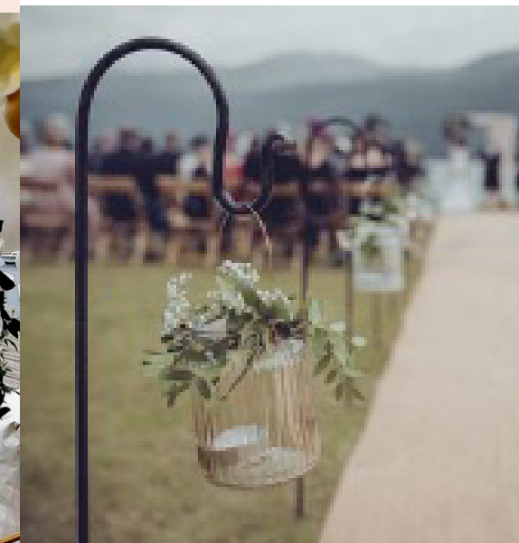
Shepherds Crooks & Glass Jars (flowers extra)