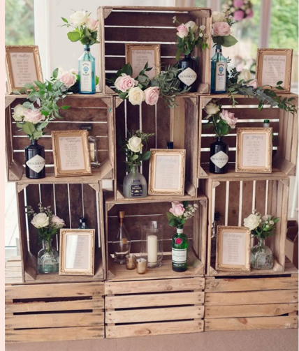
Rustic Fruit Crates