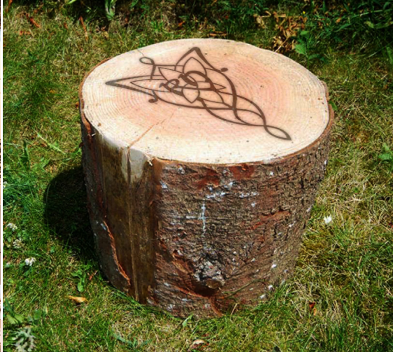
Seating Logs (personalised)