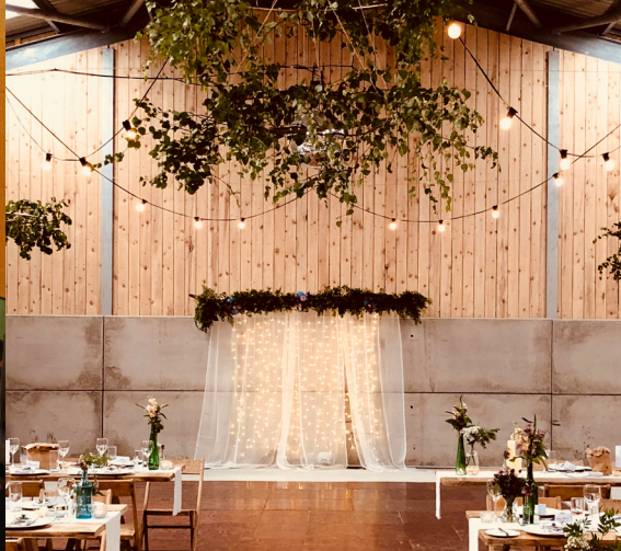
Various types of Ivy & Foliage