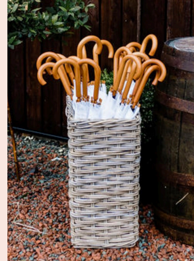
Umbrellas x 20 (inc holder)