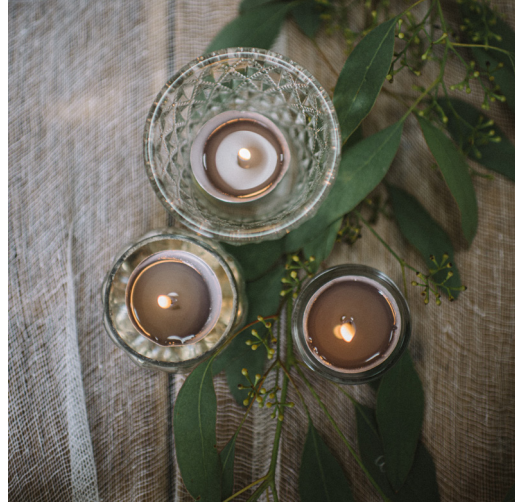
Sets of 3 tealights and holders