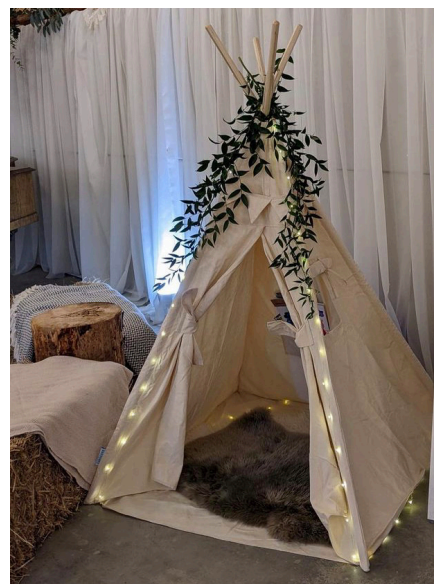
Kids Tipi (with fairy lights and cosy rug)