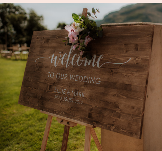
Welcome Sign & Easel - personalised