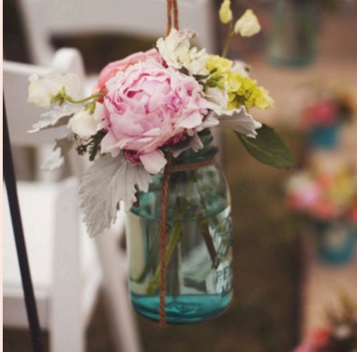
Mason Jars (minus flowers)