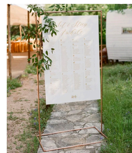
Copper Stand for Table Plan