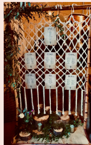
Macrame Table Plan personalised