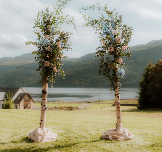
Ceremony Arbor Structure hire