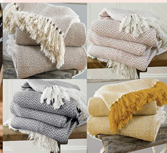
Blankets Various Colours