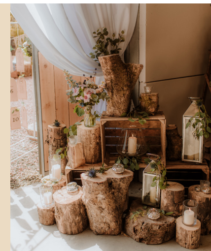
Log Installation with lanterns and candles