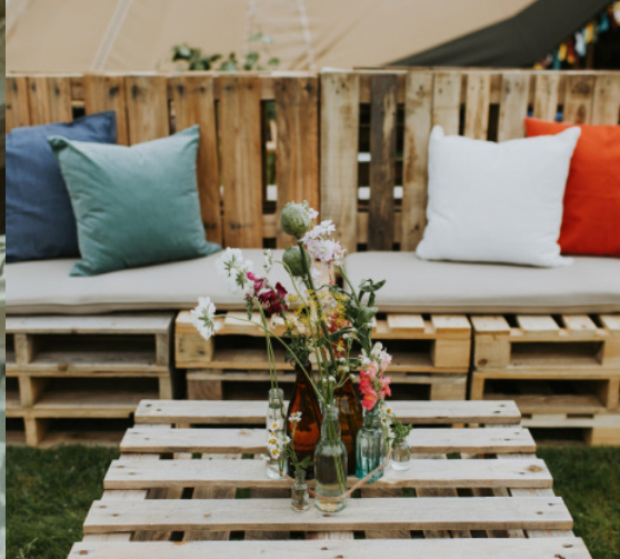
Pallette Seating & Table set