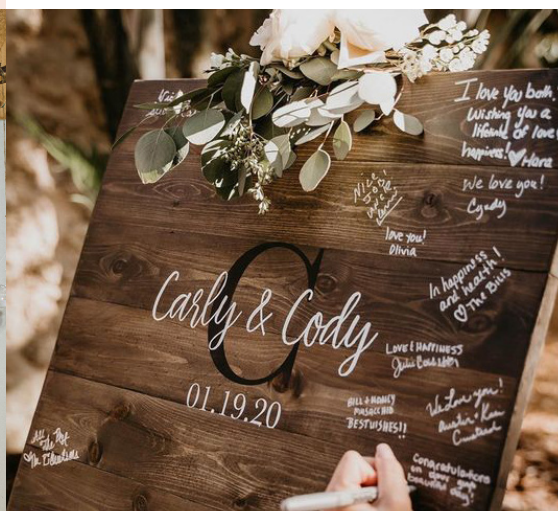
Guest Signing Station