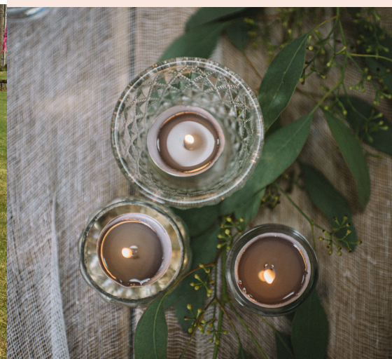
Candle Holders & Tealight set