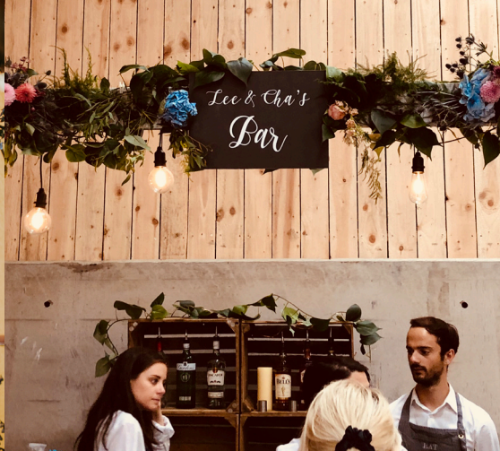
Personalised Bar Signage & Lighting gantry