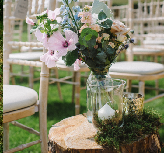
Guest Comfort (blankets, umbrellas, signage, midge repellent)