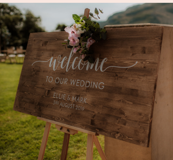
Welcome Sign Easel - personalised