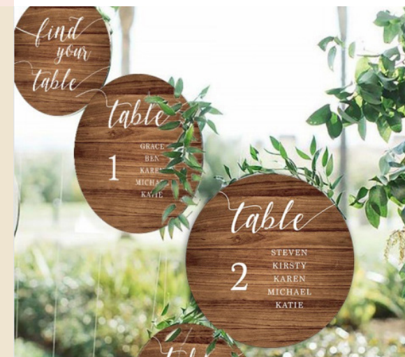
Hanging Table Plan - personalised