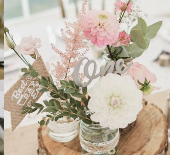
Wooden Table Slices