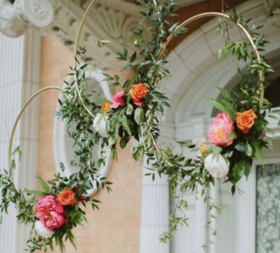
Hanging Hoops Trio with Foliage (minus flowers)