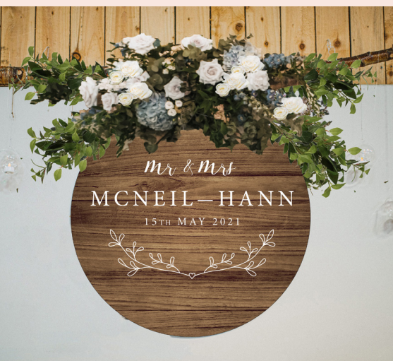
Top Table Backdrop