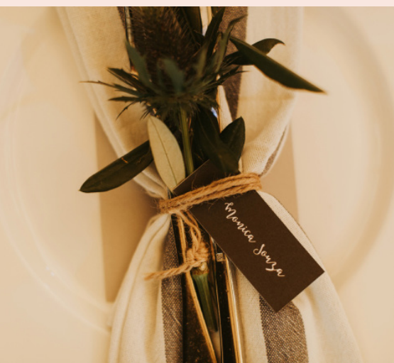
Table Place Name, Twine & Thistle