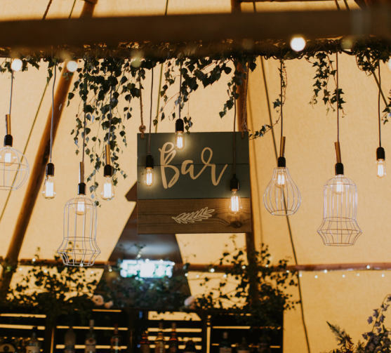
Bar Signage, foliage & hanging lighting