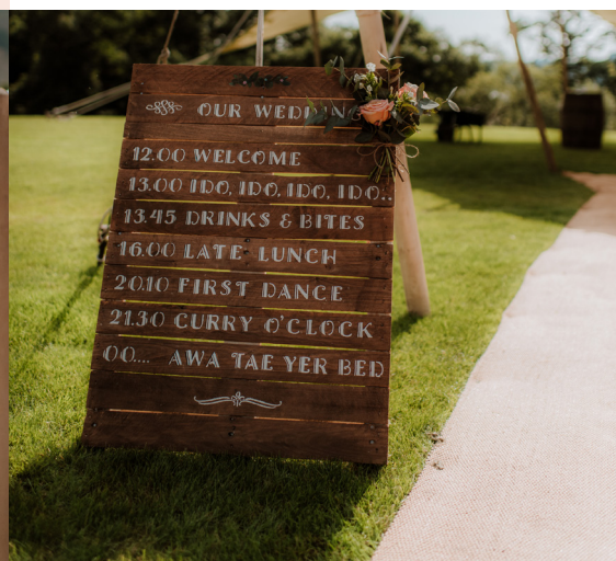
Order of the Day Palette personalised