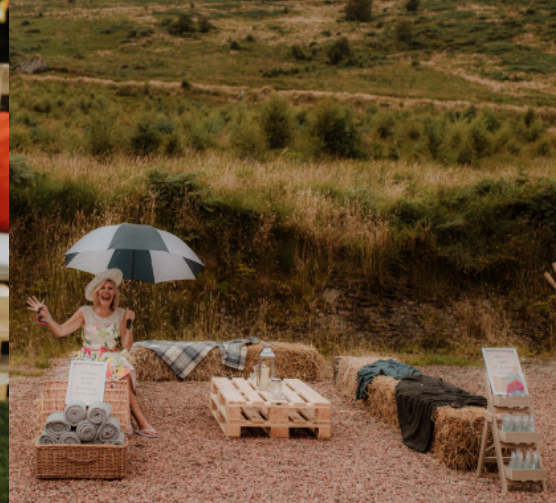
Outdoor Chillout Area