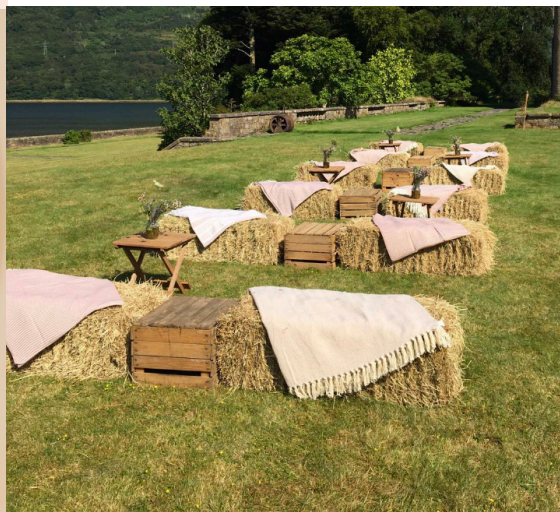
Haybale and Crate Zone