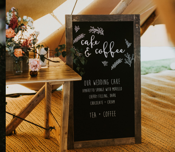
Blackboard Signage - personalised