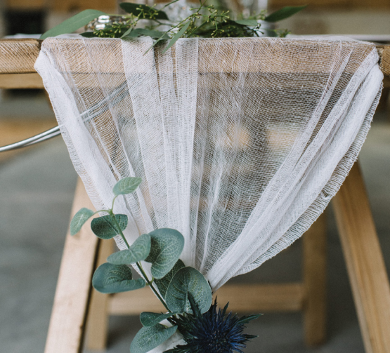
Rustic Table Runner - Guaze