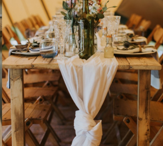
Rustic Table Runner - Linen