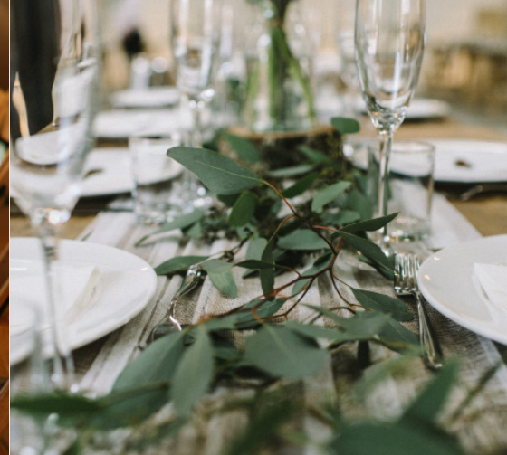
Table Runner - Eucalyptus