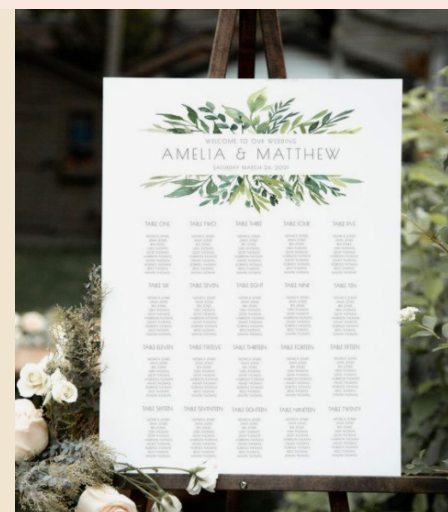
White Table Plan on Easel personalised