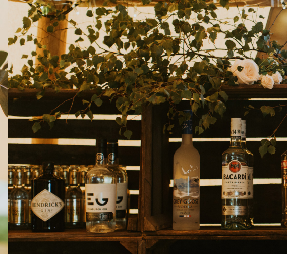
Bar Crate Gantry