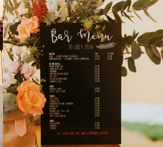
Chalkboard Bar Menu