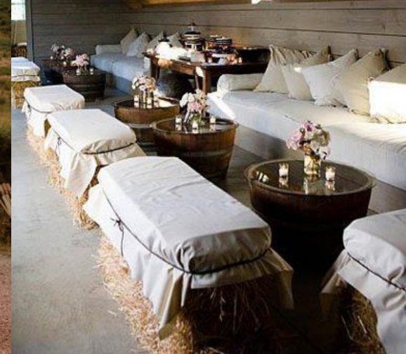
Chillout Area Haybales, Barrels, Blankets