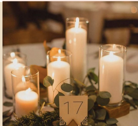
Pillar candles in Glass holders