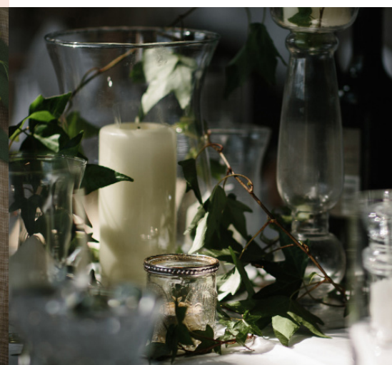
Large Glass Candle Holders